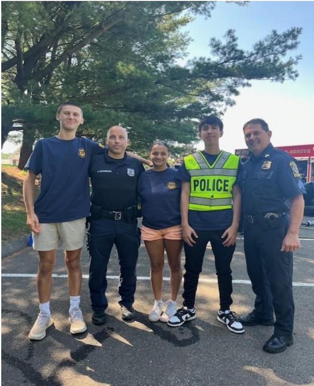
Hamden Officers and students at the Public Safety course hosted at Quinnipiac University.

The Hamden Police Department Community Division conducted a tour of the Hamden Police Department for the Hamden Transition Academy.